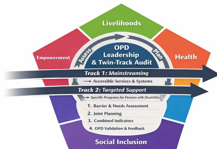
Figure 1: The Centered Twin-Track CBID Model – Kenyan Application Framework

the same matrix but superimposes the principles of the twin-track as obligatory transversal factors (Banlanjo et al., 2025). This involves a systematic elimination of barriers and integration of disability in all general practice of community development. Track 2 (Targeted Empowerment) guarantees that there is provision of disability-specific support such as rehabilitation, assistive technology, Organisation capacity building to Organisations of Persons with Disabilities (OPDs) and peer-led interventions (African Disability Rights Yearbook, 2024). These two tracks act as complementary pillars, where there is coordination systems and accountability systems in the county and community levels. The five CBID components are displayed in Figure 1 in a pentagon with two heavy transversal arrows (Track 1 and Track 2) passing through each component (Banlanjo et al., 2025). The centre is OPD Leadership and Twin-Track Audit, and there is feedback loops to show the processes of planning, implementation, monitoring and adjustment are iterative.